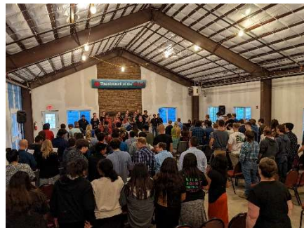
Youth Camp service in The Crossing

Thirdly, it was a great blessing to be able to use the Rasmussen Crossing for our auditorium . The building is much nicer, even in an incomplete stage, than our old auditorium. It is also in the center of camp which made the convenience of it a noticeable upgrade. We were able to use the building temporarily by having a rented restroom trailer next to the building and available before and after services. Though it was a costly endeavor, we believe it made a large difference in the effectiveness of camp.