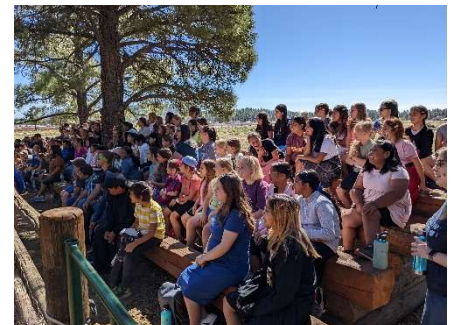
Junior Campers at the Rodeo Corral