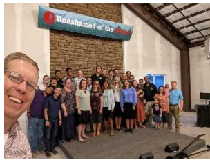
Our summer staff has headed back home before starting fall school, college, and job responsibilities

Summer turns to fall very quickly here. While that can be true about the weather, it is an even more accurate description of our schedule. Though we just finished summer events and said good bye to our summer volunteers, we are already starting our fall retreat schedule. This week we have about 35 men from Phoenix coming for a two-night men's retreat. Then in early September we will be heading to Phoenix to hold our annual Arizona Regional Youth Conference.