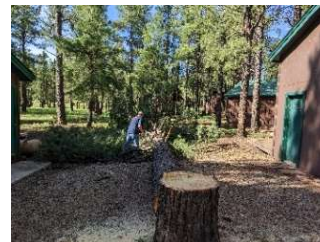
A hazardous, rotten tree removed